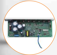
PCB Intelligent detection voltage and temperature