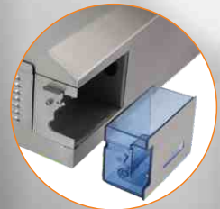
Removable water tank With external valve for easy emptying