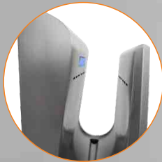
Water from hands is collected No hazardous water waste on the floor