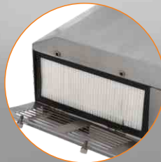
HEPA + flannelette Blocks 99.95% of 0.3 \mu\text{m} particles Flannelette can be washed for repeated use.