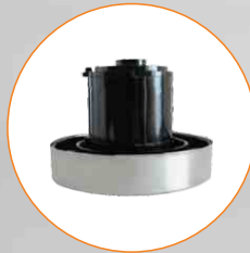
Brushless motor DC Complete closed structure to protect brushless motor and stainless steel rotor