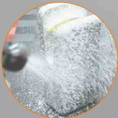
Can be washed and disinfected